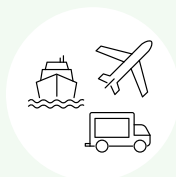
Prevention of air pollution