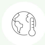
Response to Climate Change