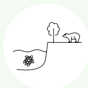
Preservation of Marine Environment and Biodiversity